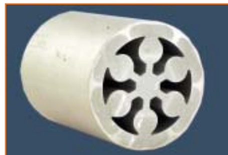
Extruded end cap cradles uranium rods in a nuclear reactor.

Aluminum alloy 5052 is the non-heat treatable alloy required for this end use, offering consistent, uniform strength and finish from piece to piece. Reliability and structural integrity are always of critical importance in nuclear power equipment.