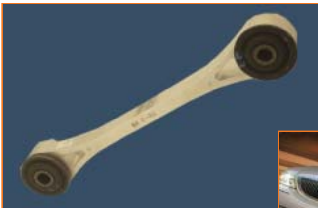
Extruded suspension link revs up performance.