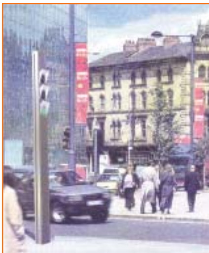
STOP! In the name of innovation. A Purdue student's design shows a new way for roadway safety signals.