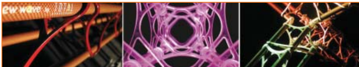
New Wave Truss presents limitless visual possibilities.

Another winning innovation in the commercial sector uses complex extruded web sections to form the New Wave Truss by Total Structures, Inc., of Ventura, California.