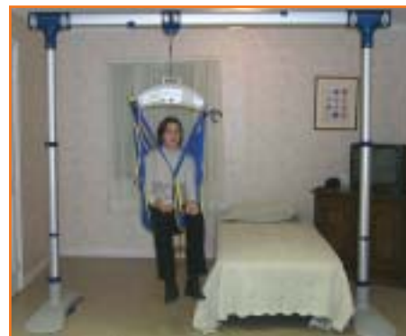
The Sequoia 2-Post lifts and transfers patients with ease.

Sequoia's designers devised this system using 13 different aluminum extruded profiles, totaling 31 parts. Designers pushed the extrusion envelope by addressing more than 40 points of contact over two key profiles: the system's top and bottom tracks. The strong, lightweight tracks are manufactured to tight tolerances to allow the trolley to run seamlessly between each profile and maximize system