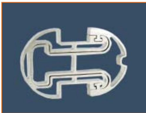
One of many extruded profiles used in the Sequoia 2-Post system.

The Smartframe home design integrates into a neighborhood with infinite flexibility in the plan and exterior appearance, allowing self-expression and community identity to emerge. The Smartframe concept could also be used as emergency shelter, disaster relief or military operations housing, due to its lightweight, reusable components. The modular layout offers more than 40 floor plans, with a typical three-bedroom home of approximately 1,440 square feet costing an estimated $40 per square foot, after start up and initial tooling costs are amortized by mass production.