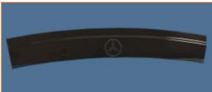
Erbsloeh's extruded roof rail is an attractive streamlined design.

The International Aluminum Extrusion Design Competition's Grand Prize Winner is a rounded extrusion profile from Erbsloeh AG, Germany, forming the roof rail in lightweight automotive body space frames, such as the prototype for Daimler-Chrysler AG. The KTL-coated and painted roof rail is extruded to extremely tight tolerances suitable for laser welding. The rounded component offers uniform, even surface topography, avoiding the pitfalls of an orange peel surface or grooves created by previous cold working methods. The rail reinforces the lightweight automotive body concept that is crucial to reducing fuel consumption.